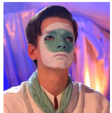
2. Common Face design